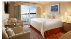
Standard Balcony Cabin