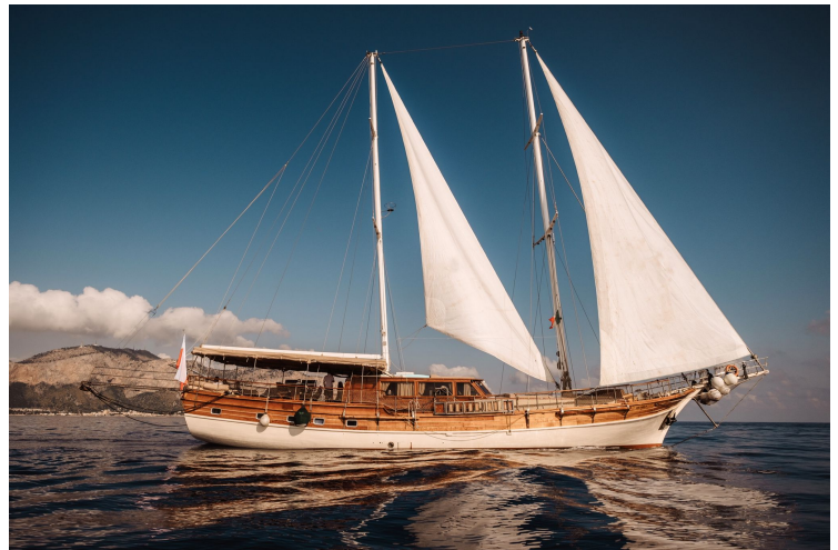
Deckhand & Steward

download limits. Amenities: Sailing equipment, snorkeling sets, kayaks, fishing rods, paddle boards, TV, DVD, music system, card games Crew: Captain, Chef,