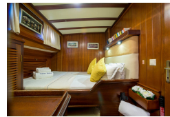
Full Ship Charter