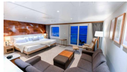
Bridge Deck Balcony Stateroom