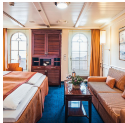
Category D. From