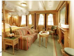
Category A: Suites with balcony. From