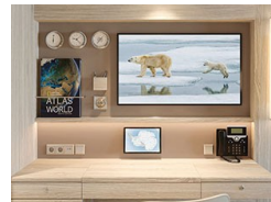
Category 5 Suite A Solo