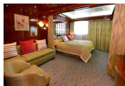
Byrd Deck Superior Suite ■