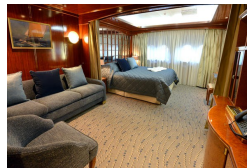
Byrd Deck Superior Sole