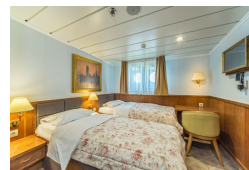
Category D Solo