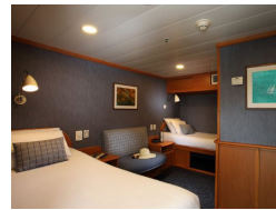
Classic Family Cabin