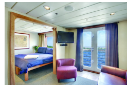
Jr Commodore Cabin