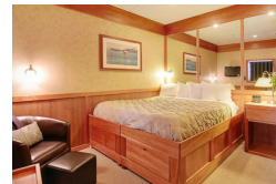
Jr Commodore Suite