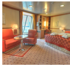
Polar Outside. From