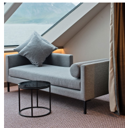
Polar Outside. From