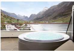
Prestige Deck 5 Suite