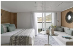
Grand Deluxe Suite