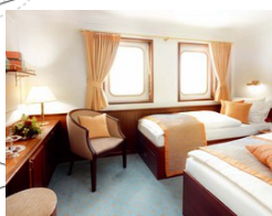
Category 3. From