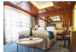
Main Deck Suite