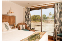
Main deck cabin for single occupancy