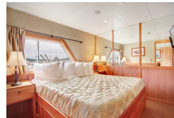
Jr Commodore Cabin