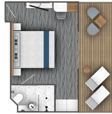
Category B Suite - Balcony Suite