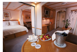
Commodore Suite Deck 3