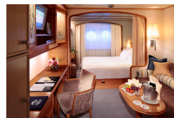
Yacht Club Stateroom Deck 3