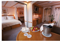
Commodore Suite Deck 3