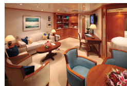
Yacht Club Stateroom Deck 2