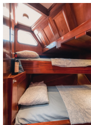
Double bed cabins