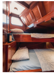
Double bed cabins