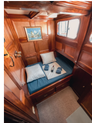
Full ship charter for 8 people