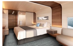
Grand Prestige Suite