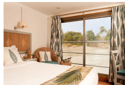
Main deck cabin for single occupancy