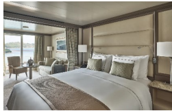
Deluxe Veranda Suite