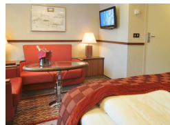
Polar Inside. From