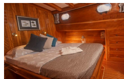
Superior Twin Cabin