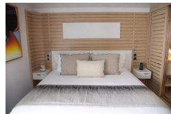
Deluxe Suite Deck 5