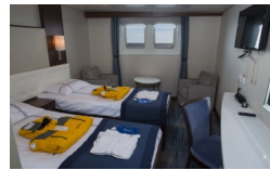
Lower Deck Twin