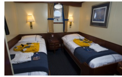
Main Deck Twin Window