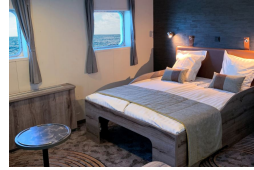
Superior - waitlist