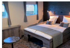
Superior - waitlist