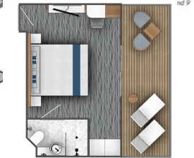
Category C Stateroom - Balcony Stateroom