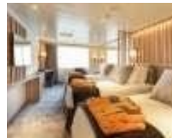
Balcony Suite. From