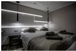
Lower Deck Cabin