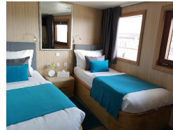
Main Deck (Twins)