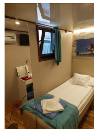
Sun Deck Cabin