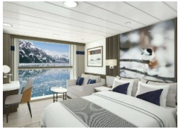
Aurora Stateroom Superior