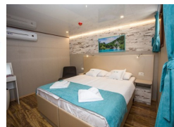
Lower Deck Cabin onboard Desire