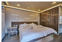
Above Deck Cabin From