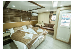
VIP Balcony Cabin