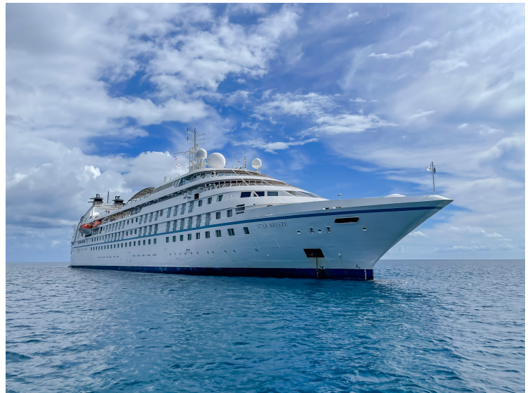
mirror and chair

Star Breeze, Star Legend & Star Pride are large enough to pamper and entertain you, yet small enough to tuck into delightful harbours and hidden coves that others can't reach. These all-suite yachts completed a renovation as part of the $250 Million Star Plus Initiative to provide more of what guests love. New public areas, including two new dining venues, a new spa, infinity pool, and fitness area. The yachts also boast all new bathrooms in every suite and a new category of Star suites, featuring a new layout. With ocean views and at least 277 square feet of comfort, Star Breeze, Star Legend & Star Pride are the perfect yachts to watch glaciers and fjords drift by from the serenity of your suite. Carrying only 312 guests, Star Breeze, Star Legend & Star Pride still tuck into small ports like Sanary-sur-Mer and Wrangell or narrow waterways like the Corinth Canal and Keil Canal. These ships include 156 suites, including 4 Owners' Suites, 2 beautiful Classic Suites, 3 Deluxe Suites, 79 Ocean View Suites, 58 Balcony suites, and 10 Star Porthole Suites. All Accommodations Feature Queen Size Bed with Luxurious Linens Waffle Weave Robe and Slippers Interactive TV Fully Stocked Mini Bar/Refrigerator Safe Direct