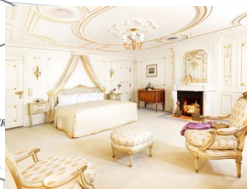
Category A. From