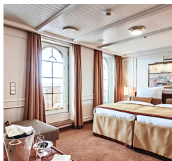
Category B: Junior suites with balcony. From