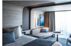
Deluxe Suite Deck 8