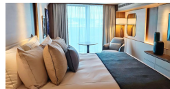
Deluxe Suite Deck 7