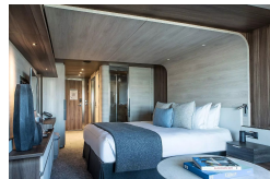
Grand Prestige Suite