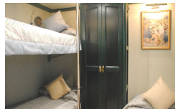
Tween Deck Standard. From