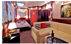
Main Deck Premium. From