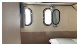
Main Deck Cabin (one available)