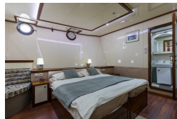
Lower Deck Cabin - Sole Occupancy