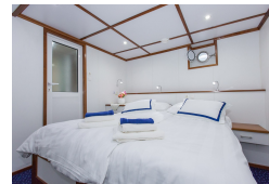
Upper Deck Cabin