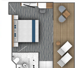
Category C Stateroom - Balcony Stateroom