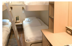
Polar Outside. From