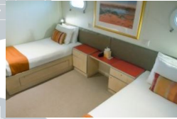
Ocean Premium Cabin