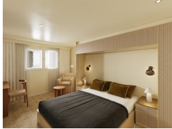
Ocean Twin Stateroom