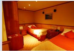
Atenas deck twin/double cabin