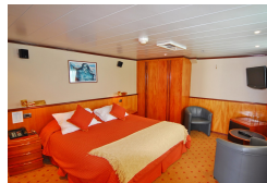
Olympo Deck double/twin cabin