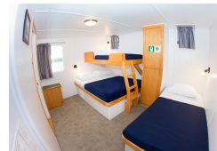
Cabins 3, 4, 5, 6 & 7