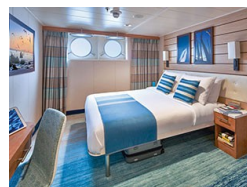
Category 2 Solo