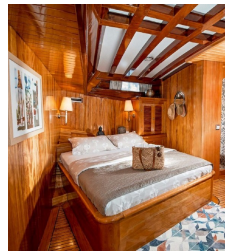
Superior Double Cabin