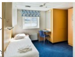
Category 2 Standard Twin