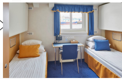
Category 2 Standard twin sole use